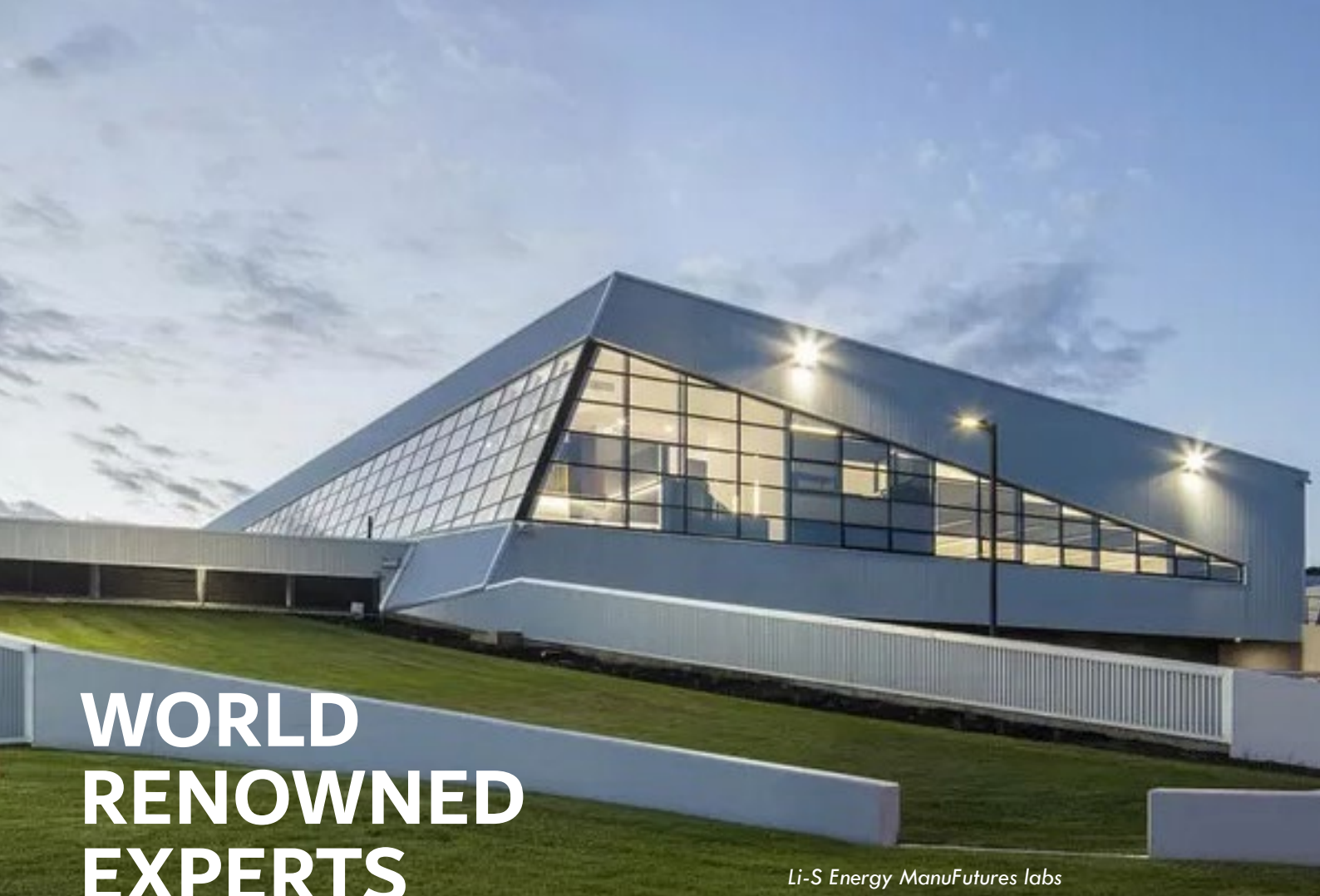
Li-S Energy ManuFutures labs